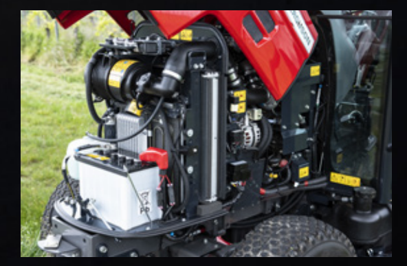
The waisted bonnet and front axle design ensures comfortable access to the engine.

Everything we offer has been scrutinised by our engineers from all perspectives – optimum compatibility with your machine, safety, durability and performance. You'll get expert service from your Massey Ferguson dealer who has all the necessary installation tools and knowledge at their fingertips.