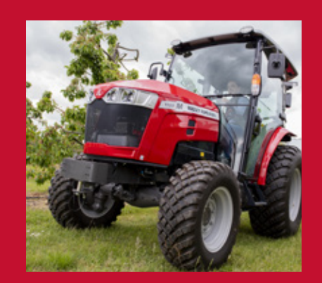
MIXED SERVICES TYRES