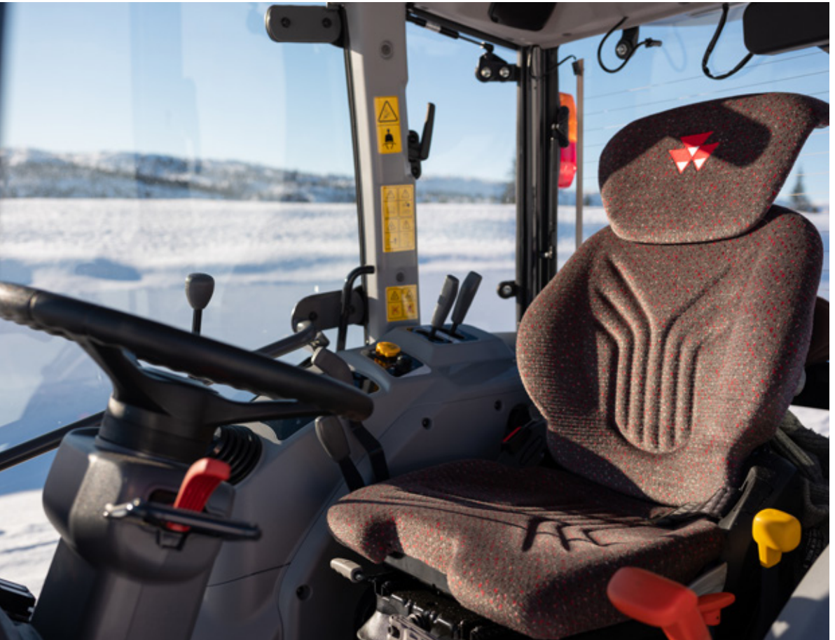
COMFORTABLE WORKPLACE FOR AN EASIER DAY Optional air suspended seat available