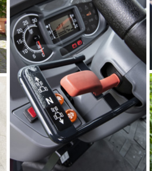
MF 1700 M models to improve