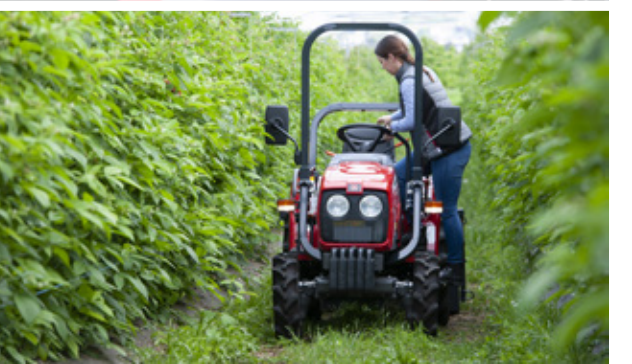
Electro-hydraulic shuttle lever on EASY ACCESS from both sides with foldable rear ROPS

Features may differ depending on model. Ask your MF Dealer for more details.