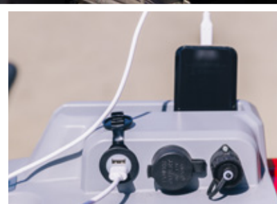
PHONE SUPPORT with 2 USB ports and 12 V Well positioned hand throttle lever socket