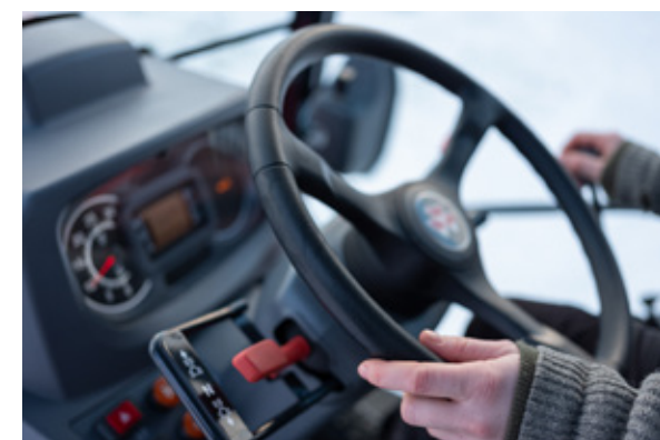
Mechanical transmission with Power Shuttle on the MF 1700 M-12Fx12R speeds for maximum comfort for each application.