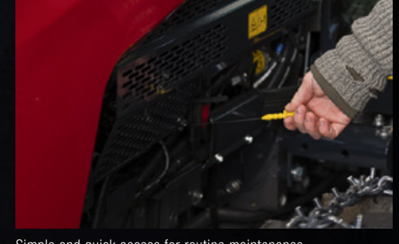
Simple and quick access for routine maintenance