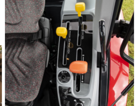
Colour coded levers make operations fast and easy