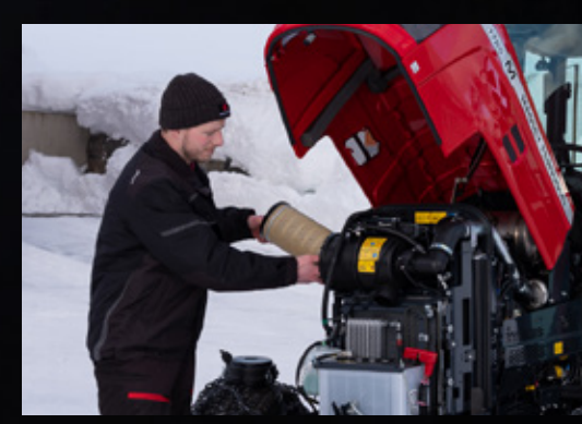
The well proportioned cooling package is easy to access, clean and maintain. The engine air filter is also very easy to access