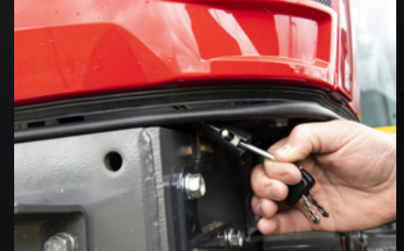
Easy bonnet opening.

We have combined practicality with style to ensure daily maintenance is speedy, straightforward and simple, taking the stress out of maintaining your tractor, getting you to the field earlier for greater productivity and giving you some free time. With a Massey Ferguson MF 1500 and MF 1700 M Series tractor, time spent in the yard preparing for the day ahead is kept to a minimum.