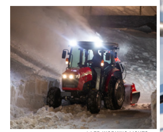
4 LED WORKING LIGHTS two front and two rear

SOMETIMES IT'S THE SMALL DETAILS THAT CAN MAKE A HUGE CHANGE TO YOUR WORKLOAD.